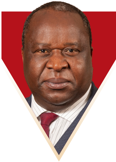
Minister of Finance TT Mboweni

In the year 2019 we celebrate 25 years since the dawn of democracy and reflect on the achievements of a united South Africa. Remarkable progress has been made to expand opportunities and build a vibrant democracy while maintaining economic stability in the face of significant headwinds. On the eve of the sixth democratic administration, a number of old challenges remain while new ones have emerged. Though the past rainy seasons have recently given way to dry spells, our resilience and capacity for self-correction is being confirmed by recent actions to restore trust in our institutions, attract investment into our economy, and plant the seeds of an economy that works for all South Africans.