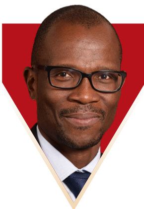
Deputy Minister of Finance David Masondo (MP)