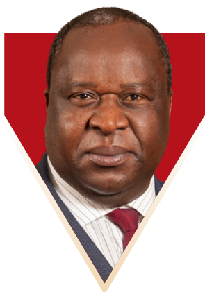
Minister of Finance TT Mboweni (MP)